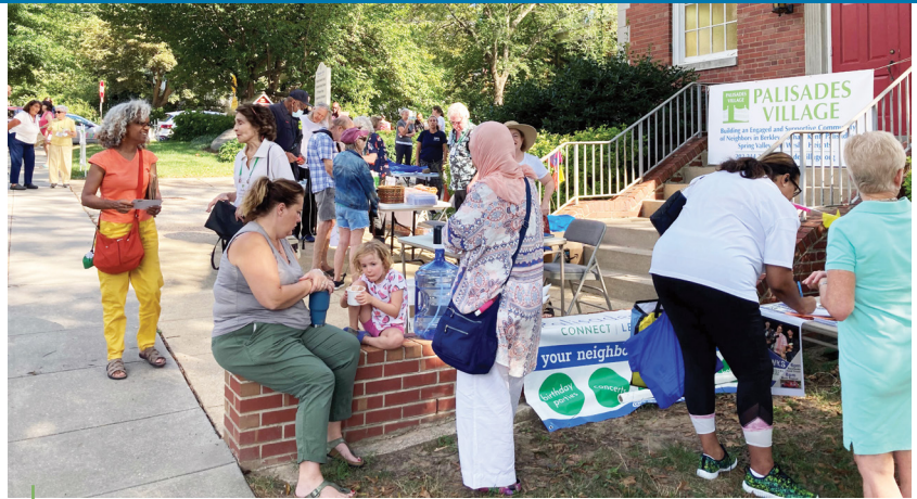
The community came out for our Happening with food, games, and health & wellness activities.

Wellness (Fitness, Yoga, Tap Dance and Walking) 841 participants