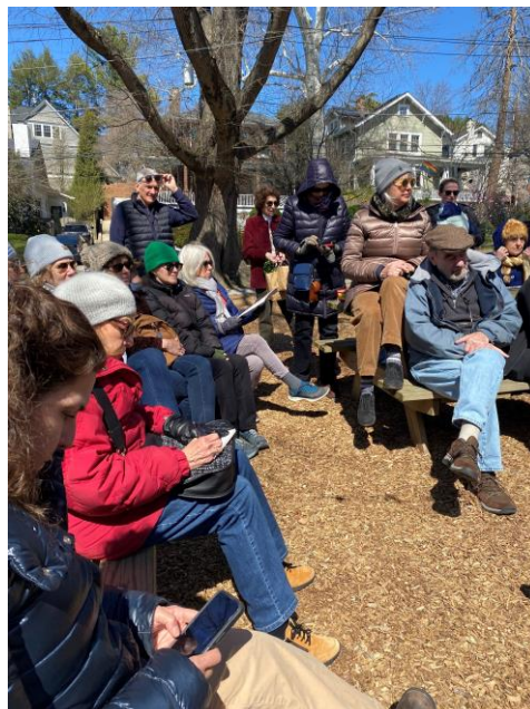
It was a captive audience.