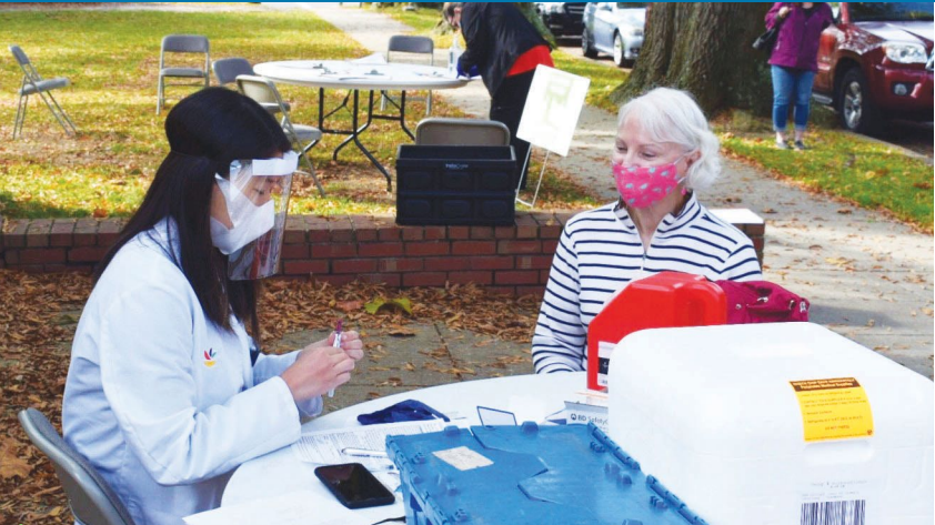
Flu Clinic 2020