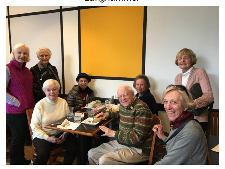
Outing to see the Renoir exhibit