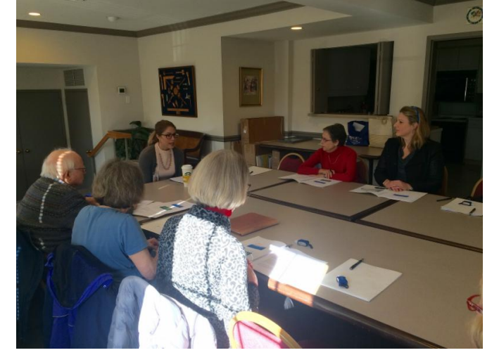
Presentation on the Etiquette of Illness