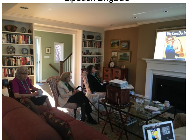
Lipstick Brigade Talk